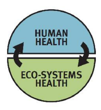
Figure 1 Human and eco-systems health

We express this as 'ecological public health', projected by the simple graphic shown as Figure 1, which is revolutionary in its implications. The concept also appears in the literature, but so far only at the margins, despite the support of influential public health bodies. The challenge for this century is to work out the meaning and purpose of public health at a time of acute and critical threats to the environment, to eco-systems, and to the biosphere. The natural and physical world is not a limitless treasure of resources for human exploitation. The biological world cannot be